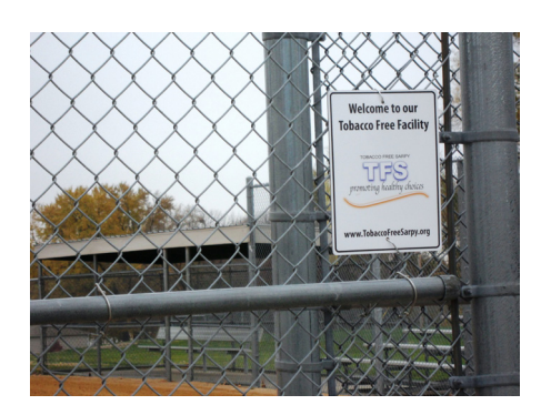
La Vista Sports Complex - Tobacco-free since 2012