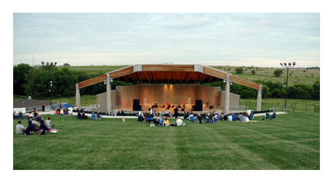
Sumtur Amphitheater - Tobacco-free since 2007

To promote and to advocate for healthy tobacco-free lifestyles through public policy, education and enforcement.