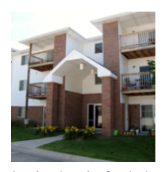
Highland Meadow Apartments - Smoke-free since 2011

Funding provided by the Nebraska Department of Health and Human Services/Tobacco Free Nebraska Program as a result of the Tobacco Master Settlement Agreement