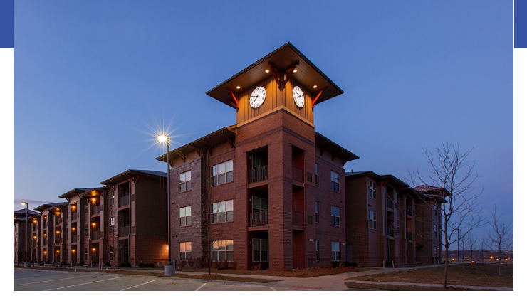
Shadow Lake Square Apartments - Smoke-free since 2013