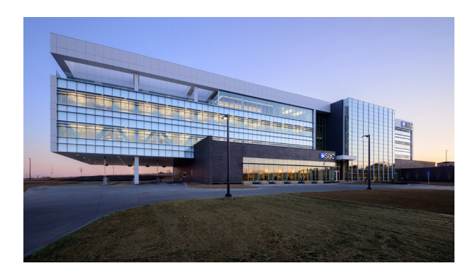
SAC Federal Credit Union - Tobacco-free since 2012

To empower the community to advocate for reduction of tobacco use by changing norms. TFS will promote prevention and policy change through increased community education and awareness.