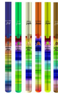
Disposable hookah pens